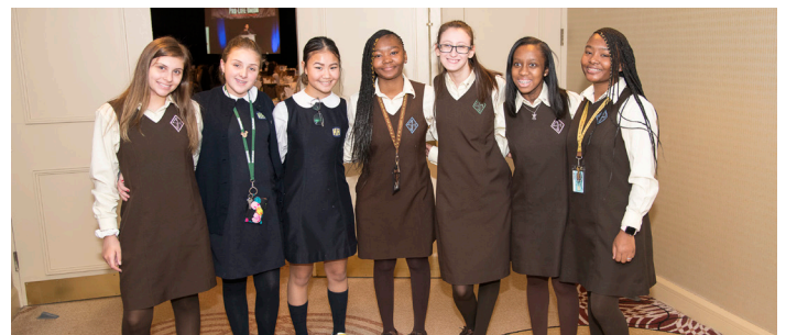
Pictured (above): Local high school students celebrated the evening at the 38 th Annual Stand Up For Life Dinner.