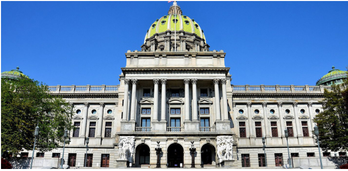
Pictured (above): The Pennsylvania State Capitol building.