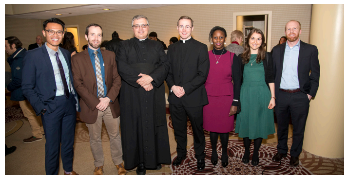
Pictured (above): Local parishioners and clergy members also enjoyed their time at the 38 th Annual Stand Up For Life Dinner.