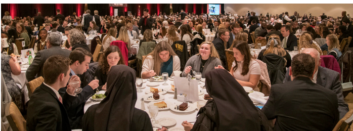
Pictured (above): Guests enjoying fellowship at this year's Dinner.