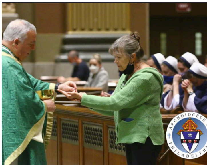
Photo above: Respect Life Month Archdiocesan opening celebration at SS. Peter & Paul Cathedral on September 27, 2020.