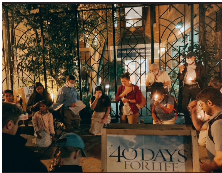
Photo to the left and above: 40 Days For Life rally and candlelight vigil in front of Planned Parenthood on 12th and Locust Philadelphia on September 23, 2020.

For the pro-life movement, overturning Roe v. Wade would be a monumental victory. But it would hardly be the end of the work that needs to be done to ensure that abortion is not just illegal, but unthinkable — so that no woman ever feels that she has no other choice or that she needs an abortion, ever again.