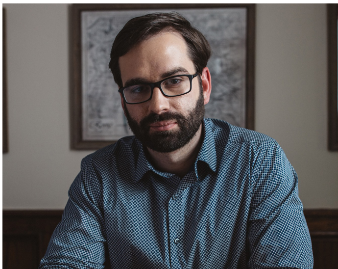
2020 Stand Up For Life Guest Speaker: Matt Walsh

I wish I could greet you in person, but I look forward to joining you virtually on Sunday, Nov. 22nd for the 2020 Virtual Stand Up for Life Live Stream. Be prepared to enjoy some great testimonies from moms, a talk by Matt Walsh, and a few other surprises.