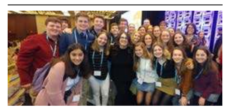
Pictured (above): Cardinal O'Hara High School students and faculty at the National Pro-Life Summit in Washington D.C.

The preborn children and their moms need you. Your witness, voice and prayers make a difference. Come and stand for life in the worldwide 40 Days For Life Campaign which will occur from February 26-April 5. 40 Days For Life is an opportunity for people to pray and fast for an end to abortion. The peaceful presence of pro-lifers outside abortion centers has helped to save 16,742 lives since 2007, also resulting in the closure of 104 abortion centers and departure of 196 abortion clinic workers who recognized the evil of the abortion industry. Want to join other witnesses outside an abortion clinic in the Greater Philadelphia region? You can become a prayerful presence in Center City, Northeast Philadelphia, West Chester, Norristown, and Warminster. For more information about 40 Days for Life locations and leaders, visit prolifeunion.org/outreach/40-days-for-life.